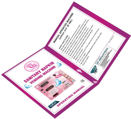
User Guide Manual