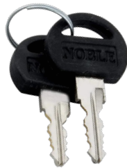
Door Lock Keys-2 pc