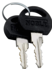
Door Lock Keys-2 pc