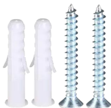
Wall Plug & Screw-2 pair