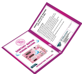
User Guide Manual