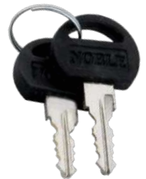
Door Lock Keys-2 pc