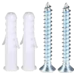
Wall Plug & Screw-2 pair