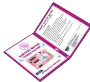
User Guide Manual